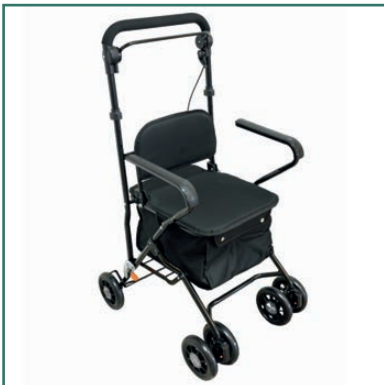
Black Cod.: 0820010311