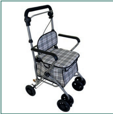
Square pattern Cod.: 0820010322