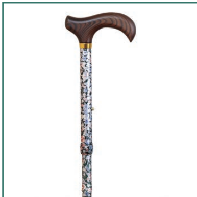
Flower pattern with wood handle Cod.: 0811020002