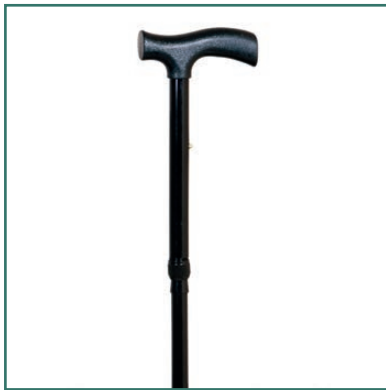
Black with plastic handle Cod.: 0811020001