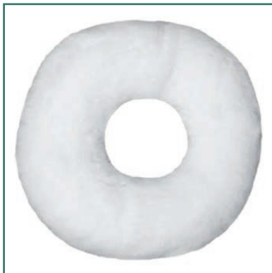
Rounded Cod.: 0840100101

Also recommended for all these people who remains on the same position during long periods.