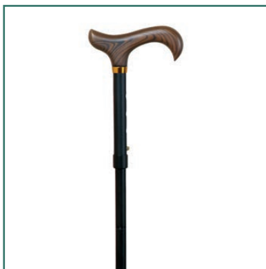
Aluminium black with wood handle (mini) Cod.: 0811020005