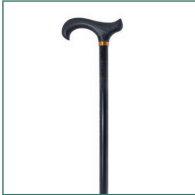
Aluminium black with soft handle Cod.: 0811030005