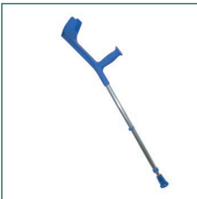
Blue Cod.: 0810000017

Integral crutch in aluminium and adjustable.