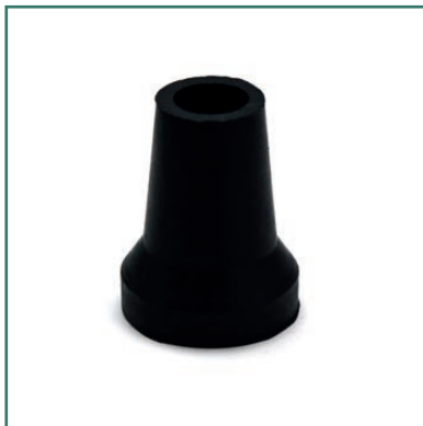
N° 1 with suction pad (18 mm) Cod.: 010597011

Rubber tip with suction pad in 18 mm for walking-sticks. Produced in black color.