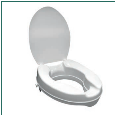
Raised toilet seat with lid Cod.: 083011001 (10 cm) Cod.: 083011501 (15 cm)