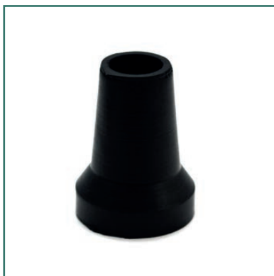
N° 2 with suction pad (21 mm) Cod.: 010597021

Rubber tip with suction pad in 21 mm for walking-sticks. Produced in black color.