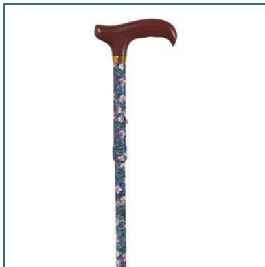
Flower pattern with plastic handle (mini) Cod.: 0811020003