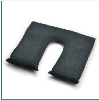
U-shape gel cushion Cod.: 0011454517

Our anti-bedsore gel cushion in U-shape is designed in a way which creates an micromassage effect and allows an equilibrated pressure distribution. Is an anti-allergic cushion and is sold with a plastic cover which can be washed. Recommended to prevent or relieve bedsore and to take a proper posture.