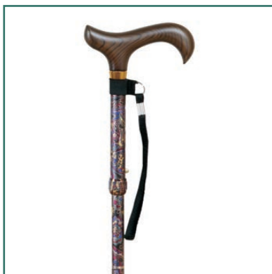
Aluminium cachemir pattern with wood handle (mini) Cod.: 0811020013