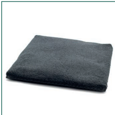
Squared gel cushion Cod.: 0012454517

Our anti-bedsore gel cushion in U-shape is designed in a way which creates an micromassage effect and allows an equilibrated pressure distribution. Is an anti-allergic cushion and is sold with a plastic cover which can be washed. Recommended to prevent or relieve bedsore and to take a proper posture.