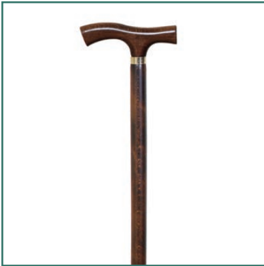
Beech wood with a ring Cod.: 0811010001