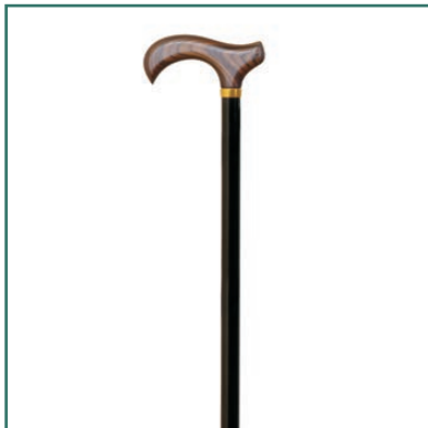
Black with wood handle Cod.: 0811030001