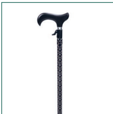
"Stand Up" black and gold with black handle Cod.: 0811030007