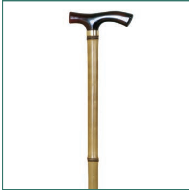
Bamboo wood with plastic handle Cod.: 0811010003