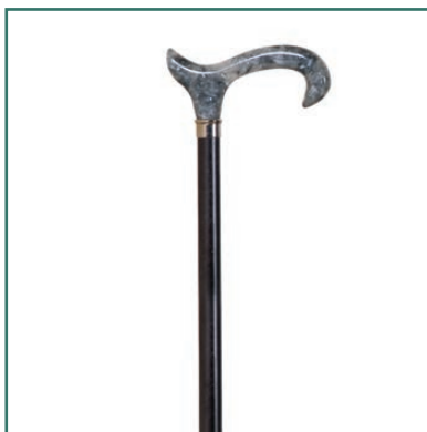
Derby wood with methacrylate handle Cod.: 0811010005