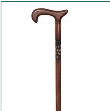
Carved wood Cod.: 0811010002