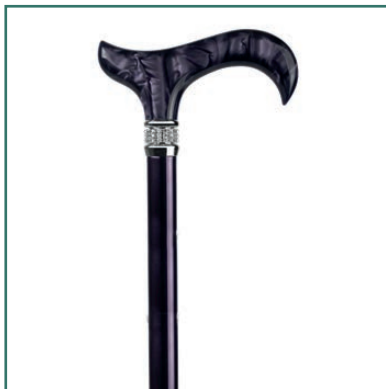
Aluminium purple with glass ring Cod.: 0811020006