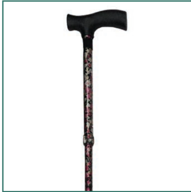
Flower pattern with black handle Cod.: 0811020004