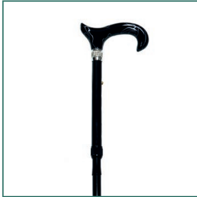
Aluminium black with glass ring Cod.: 0811020007