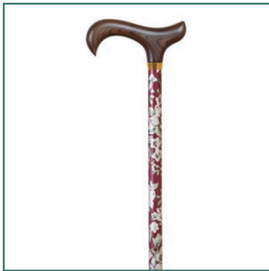
Flower pattern with wood handle Cod.: 0811030002