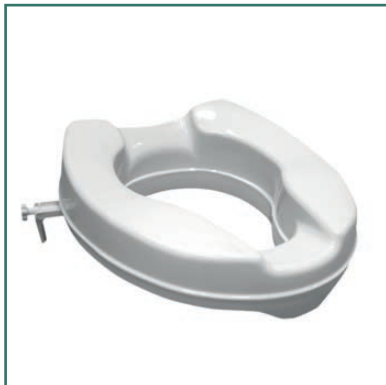
Raised toilet seat without lid Cod.: 0830101001 (10 cm) Cod.: 0830101501 (15 cm)