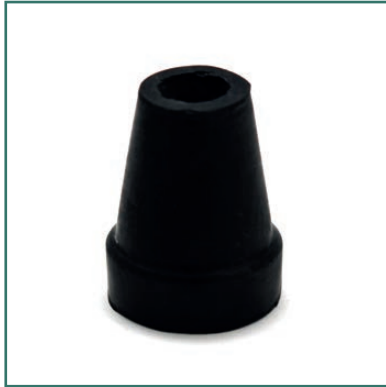
N° 0 with suction pad (16 mm) Cod.: 010597001

Rubber tip with suction pad in 16 mm for walking-sticks. Produced in black color.