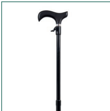
"Stand Up" black with black handle Cod.: 0811030006