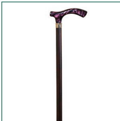
Wood with methacrylate handle Cod.: 0811010004