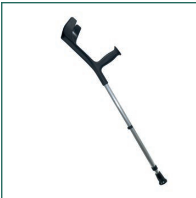
Black Cod.: 0810000011

Integral crutch in aluminium and adjustable.